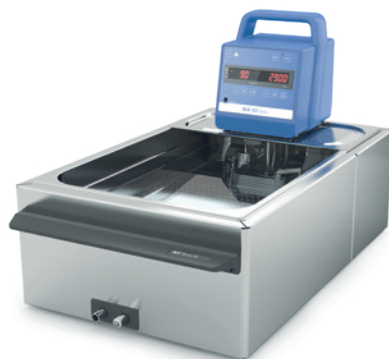
ICC basic pro 20 Immersion circulator Ident. No. 0008035200