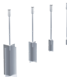
VAN-1 Adapter-Set The vane spindle set allows the viscosity measurement of suspensions Ident. No. 0025000407