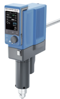
STARVISC 200-2.5 control Measuring stirrer Ident. No. 0025003604