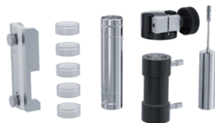
ELVAS-1 Adapter-Set Adapter to measure very low viscosities Ident. No. 0025000390