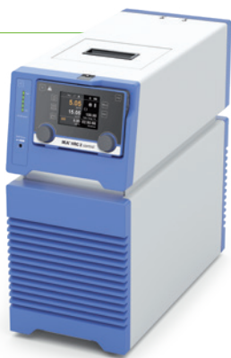
HRC 2 control Refrigerated and heating circulator Ident. No. 0025004524

If required, the following IKA devices are available for your lab to enhance viscosity measurements with your ROTAVISC: